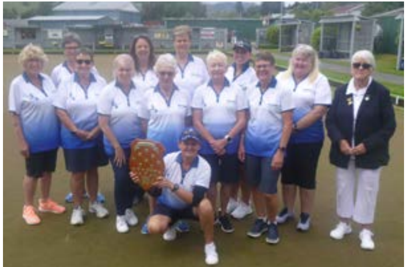
Top: Nelson women's reps' team with the Higgins Shield.

Email - wakefieldbowlsecrery@gmail.com Website - https://www.sporty.co.nz/wakefieldbowls Or contact us on Facebook.